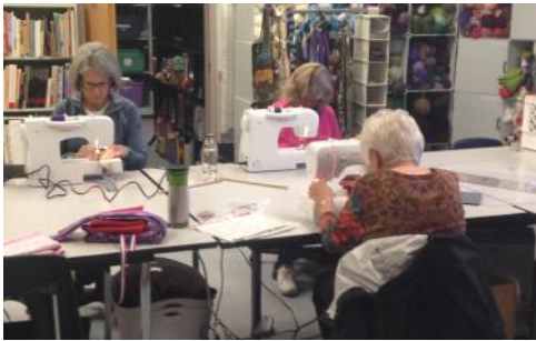
EChO Studio—page 4

Employment and more money—either through supplemental sources or higher paying jobs help individuals move forward & towards sustainability. Page 4