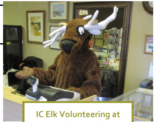
IC Elk Volunteering at EChO Resale