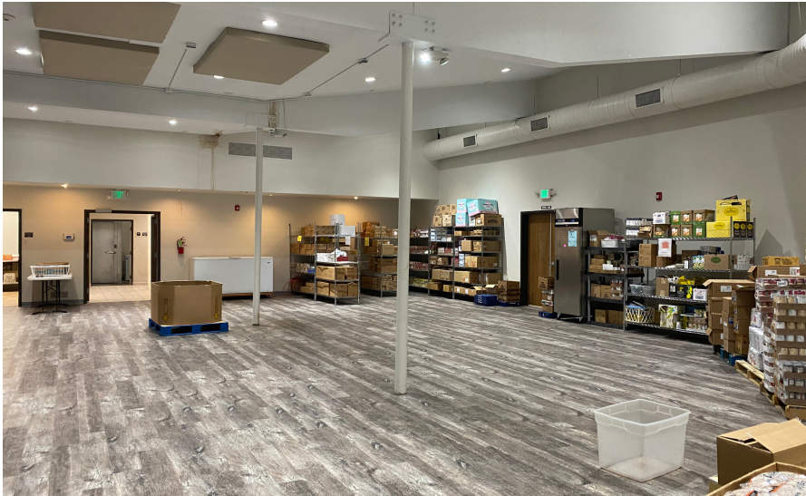
New food pantry location pictured above.

The Food Pantry is working hard to maintain their current location on the northeast side of the building while they anticipate relocating to the southwest end.