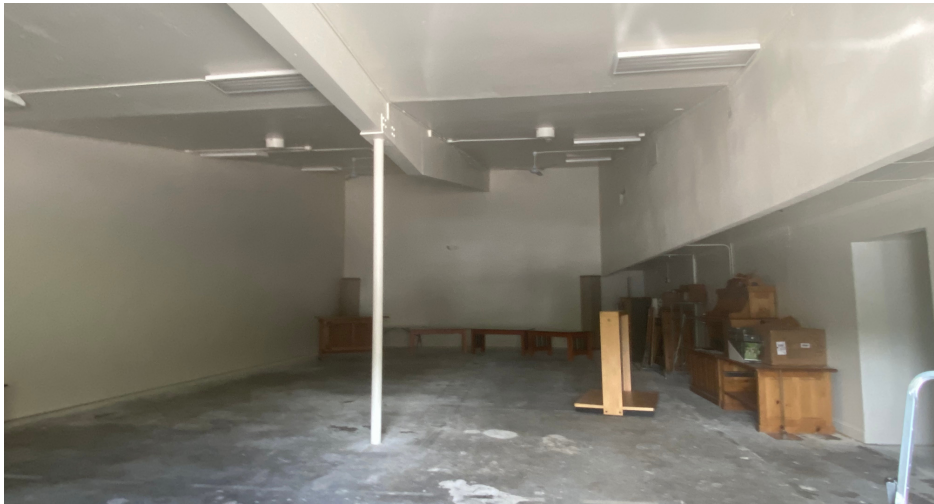
New resale shop location - awaiting renovation!

ReSale is a key component of EChO's mission to assist people in our community with basic and urgent needs and to help them realize their potential on their path to self-sufficiency. Basic needs are more than food, they're also affordable clothes for children and household goods that help provide a healthy and safe place to live. EChO provides goods free of charge if the costs are a barrier.